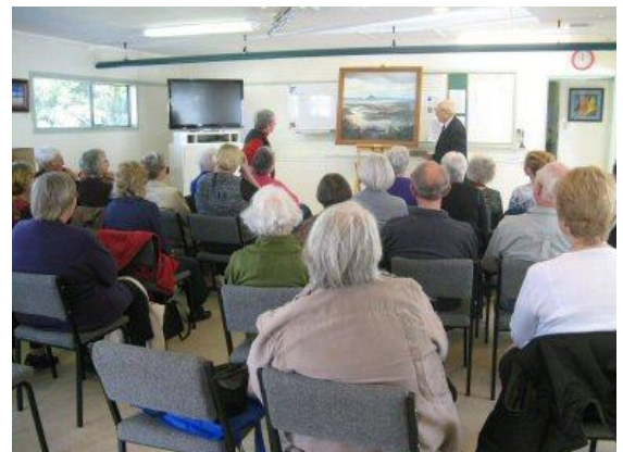
Critique Wednesday 31 August 2011

On the last Wednesday morning of each month, a Critique session is held for all members. Every month a different appointed, experienced artist is rostered to critique paintings brought in by members, to offer help and to advise. This is a wonderful opportunity to bring along your painting and gain advice on colour, perspective, technique, or any other matter that may not be quite correct in your painting. If you don't want or need advice, this is still a great opportunity to learn from the Critiquer, of ways that you can enhance your own paintings, by learning from the advice given to others. Come along on the morning of the last Wednesday of the month and give this a try or just observe. It is really interesting!